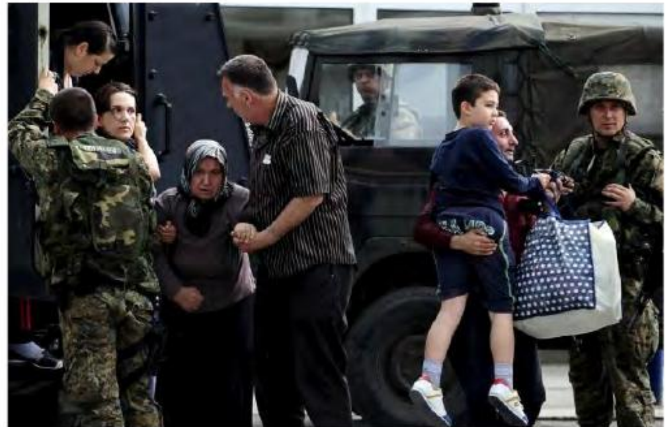
People being evacuated in armored vehicles